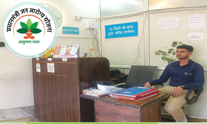
RECEPTION & OPD