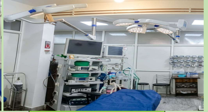
OPERATION THEATER (OT)